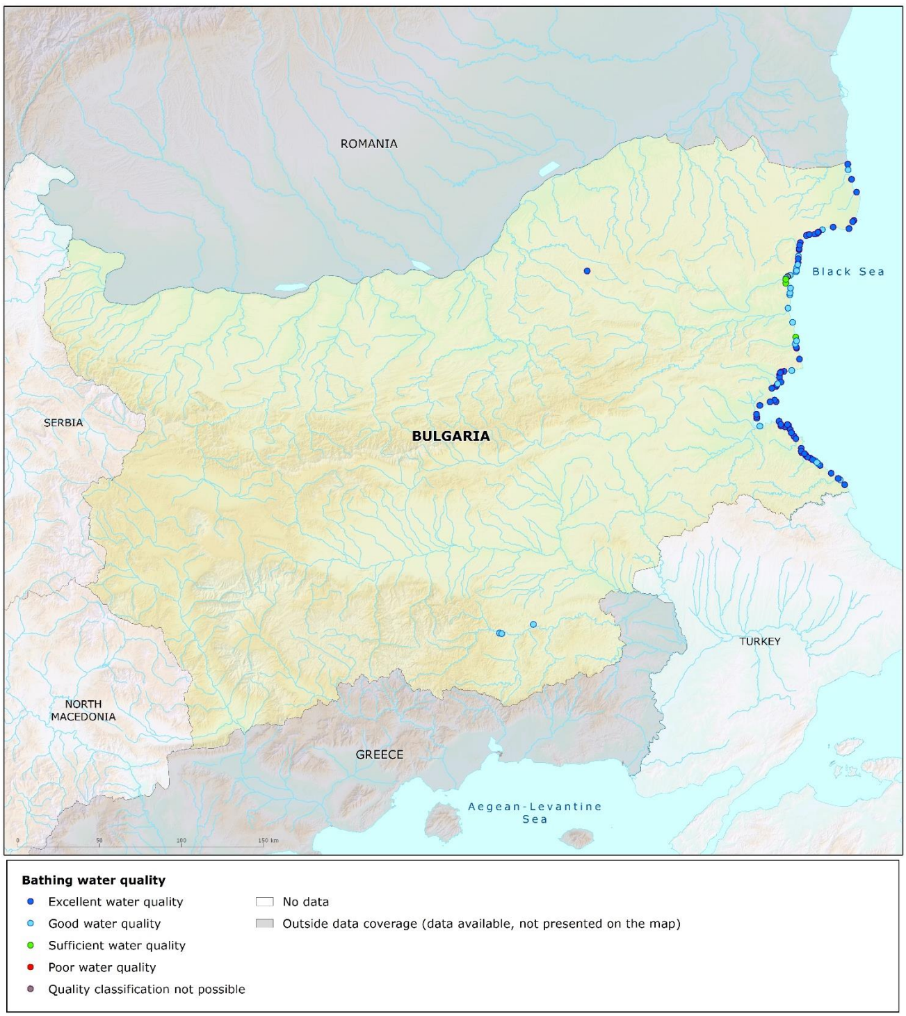
Map 1: Bathing waters reported during the 2019 bathing season in Bulgaria