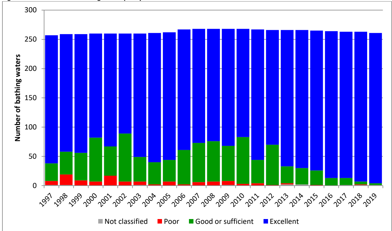
Figure 1: Trend in inland bathing water quality

Notes: Each column represents an absolute number of bathing waters in the season. The ‘good’ and ‘sufficient’ quality classes are merged for comparability with the classifications under the preceding Bathing Water Directive 76/160/EEC.