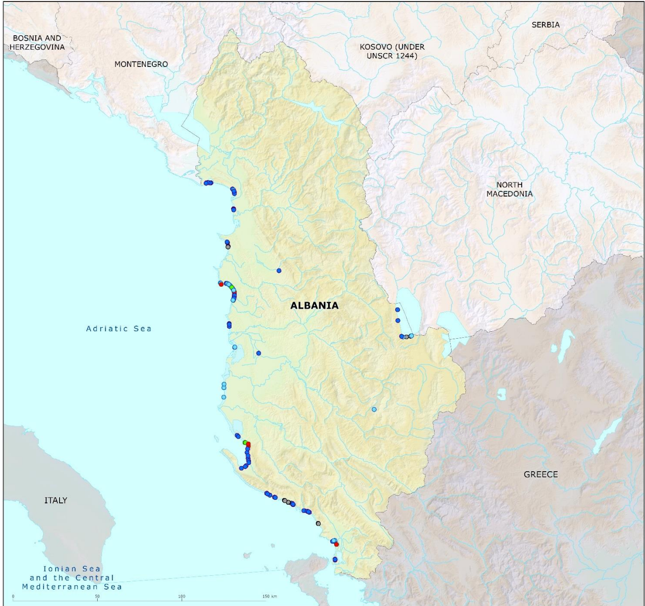
Map 1: Bathing waters reported during the 2019 bathing season in Albania