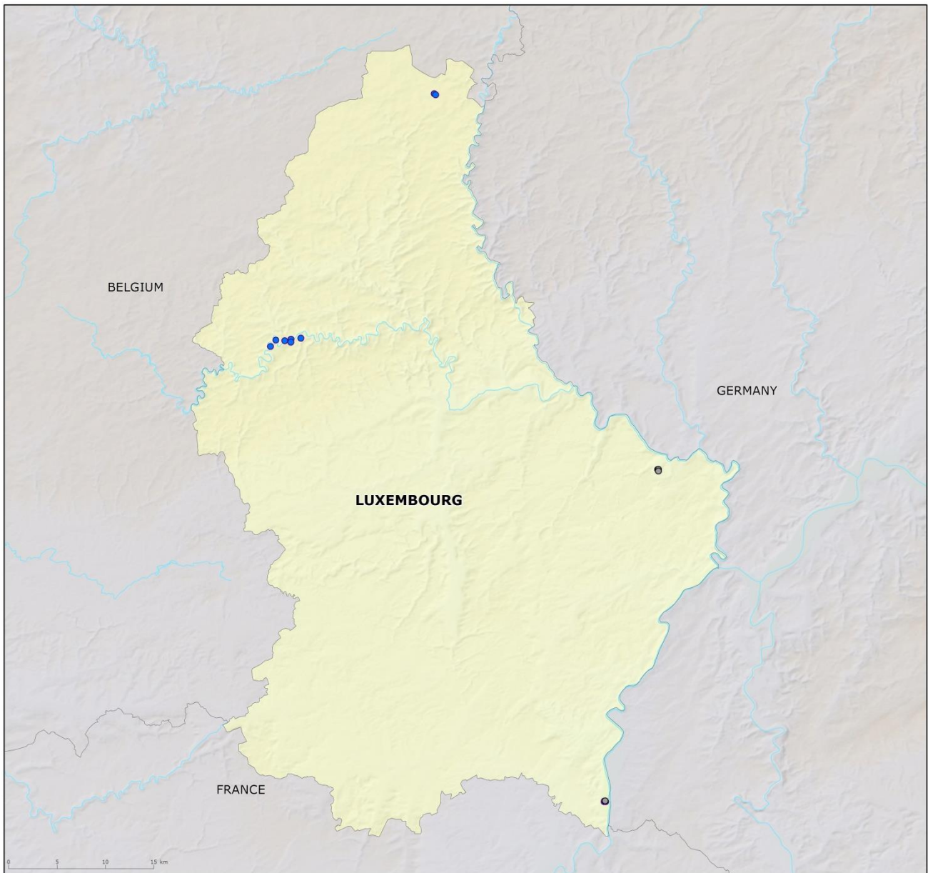
Map 1: Bathing waters reported during the 2018 bathing season in Luxembourg