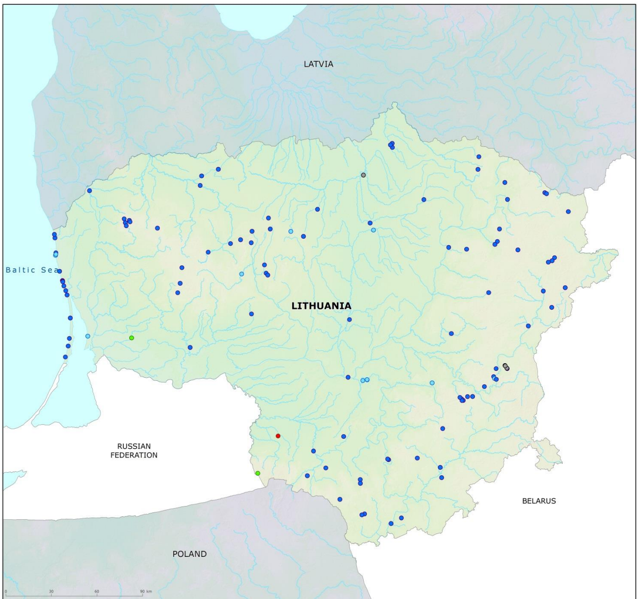
Map 1: Bathing waters reported during the 2018 bathing season in Lithuania