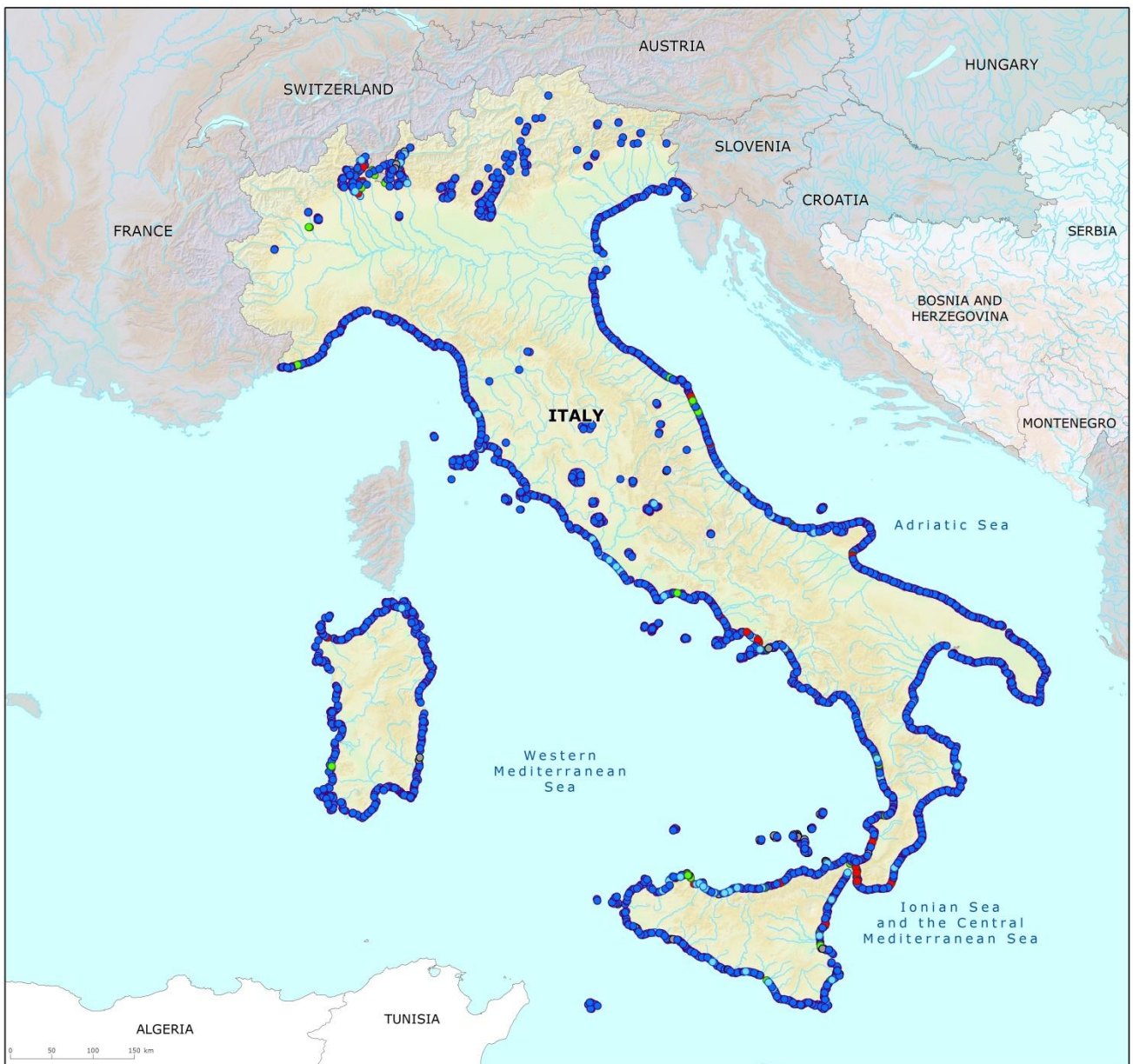
Map 1: Bathing waters reported during the 2018 bathing season in Italy